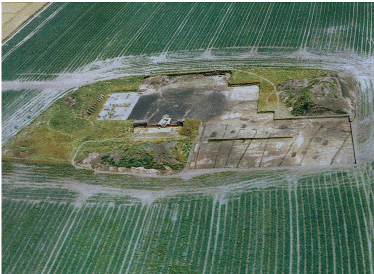
Fig. 3. Plan of the monumental cemetery at Słonowice, SE Poland.

Abb. 3. Übersicht über den monumentalen Grabplatz bei Słonowice, Kleinpolen (nach Tunia 2003).