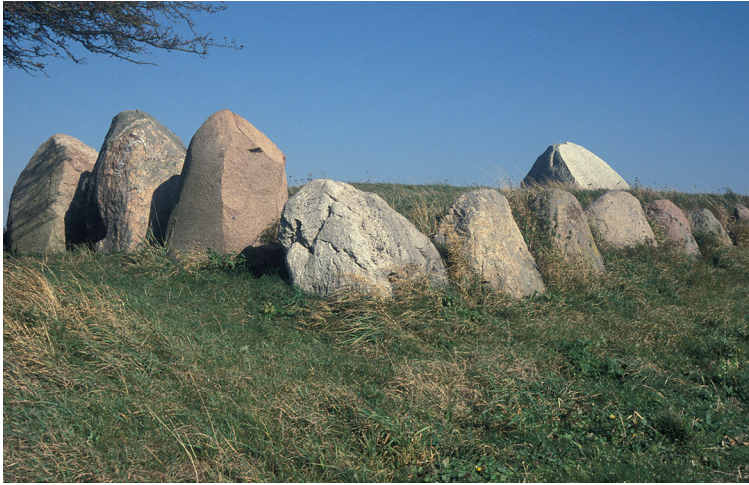
Fig. 2. Grøjægers Høj long dolmen on Møn with a burial chamber capped with white quartzite stone (photograph: M. S. Midgley).

Abb. 2. Der Langdolmen von Grøjægers Høj aus Møn mit einer von Quarzitsteinen gekrönten Grabkammer. (Foto M. S. Midgley).