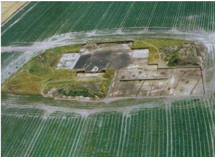
Fig. 3. Plan of the monumental cemetery at Słonowice, SE Poland.

Abb. 3. Übersicht über den monumentalen Grabplatz bei Słonowice, Kleinpolen (nach Tunia 2003).