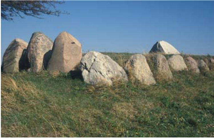
Fig. 2. Grøjægers Høj long dolmen on Møn with a burial chamber capped with white quartzite stone.

Abb. 2. Der Langdolmen von Grøjægers Høj aus Møn mit einer von Quarzitsteinen gekrönten Grabkammer..